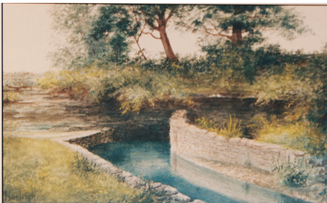
Big Spring Watercolor: 6 1/2" X 10" watercolor signed lower left, Hunleigh.